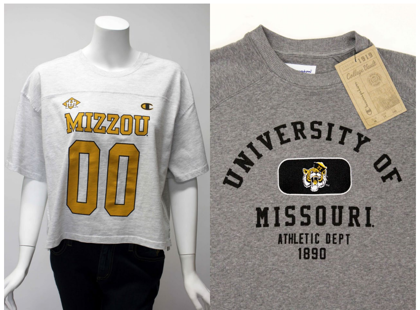
MIZZOU CHAMPION VAULT COLLECTION VINTAGE APPAREL Designs by TAM Students (2022 and 2023)