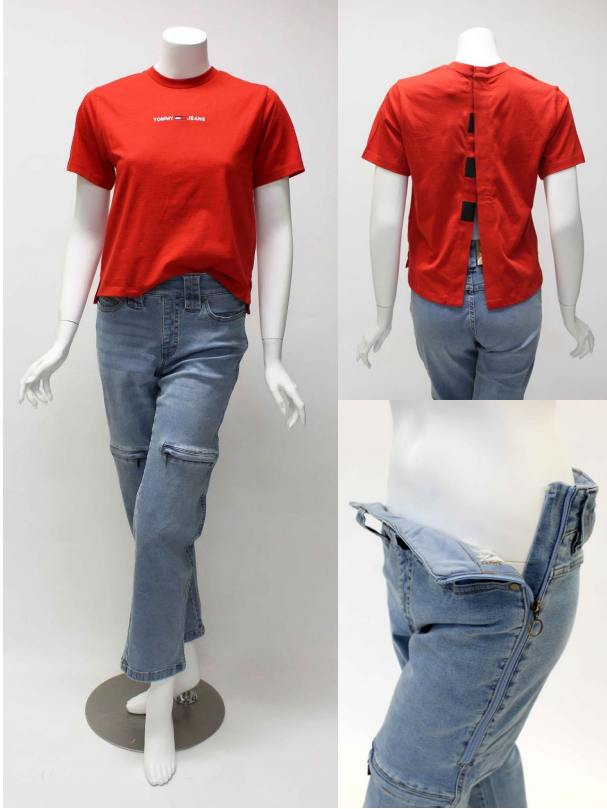
TOMMY HILFIGER Adaptive Shirt (2023; Gift of N. Johnston) and NO LIMBITS Wheelchair Pant (2023; Gift of E. Cole, No Limbits)

The MHCTC accepted 65 garment and accessory objects into its permanent collection in 2023, as well as numerous archival fashion books, catalogs, and more! The Missouri History Museum in St. Louis also donated 18 free mannequins to the MHCTC which were immediately put to good use photographing new and past acquisitions!