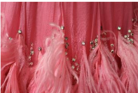
NEW ACQUISITIONS, Pages 6-7