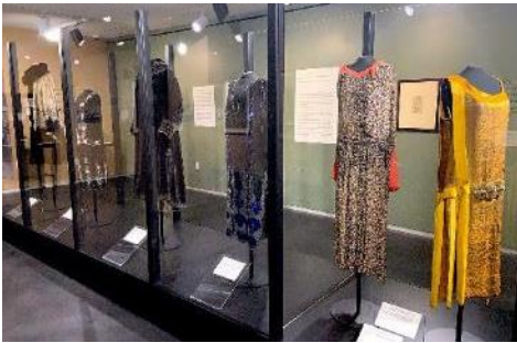
EXHIBITIONS Pages 2-3