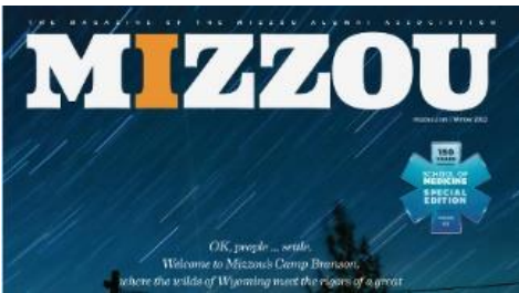
EDUCATION and OUTREACH Pages 4-5